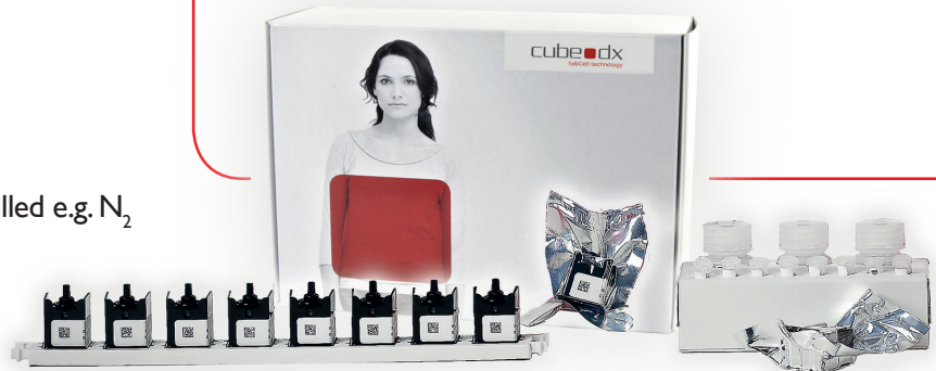
test-kit for Cube Dx including hycells and reagents