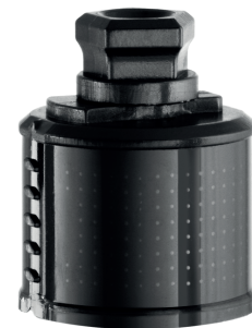
hybcell consumable for multiplex IVD assays